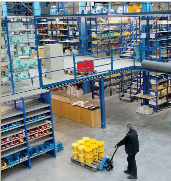
Sliding access load gate