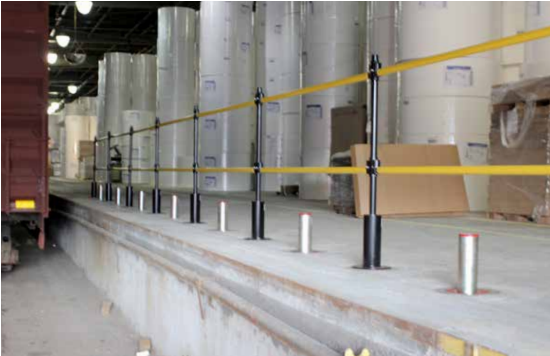
Shown with optional GuardRite Removable Handrail

A rugged steel barrier that provides heavy-duty protection and stores flush with floor when access is needed.